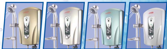
910 Titanium Gold 910 Titanium Silver 910 Titanium Blue 910 White